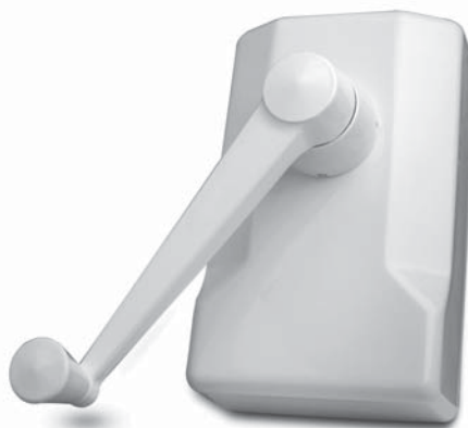
Manual Operator (Hand Crank)